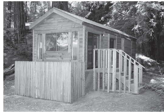
-Forest & Meadow View Cabins- *with kitchens

On weekends, Fernwood hosts live entertainment featuring many local bands and touring acts.