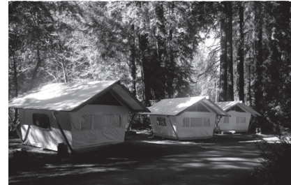
-Tent Cabins on the river-

Campsites with electric across the bridge are not available by reservation for RV's from April 1st through October 31st.